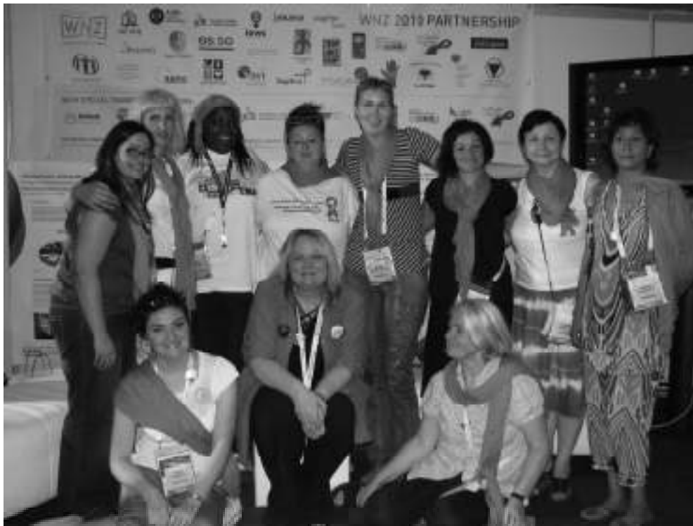
Figure 1: Participants of the Twinning Project wearing their pink scarves at a session about the project in the Women's Networking Zone, 18. IAC Vienna 2010